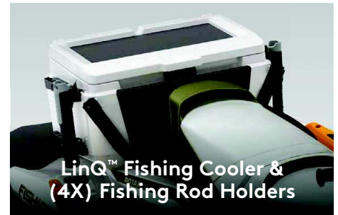
LinQ™ Fishing Cooler & (4X) Fishing Rod Holders

Optimized for ease of movement around the entire watercraft, and for better comfort and stability when facing sideways.