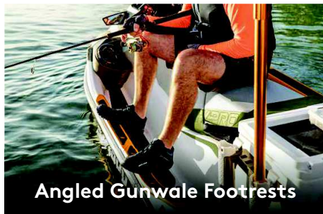
Angled Gunwale Footrests

Adds 11.5 inches to the back of the watercraft to increase stability, space, and storage capability.