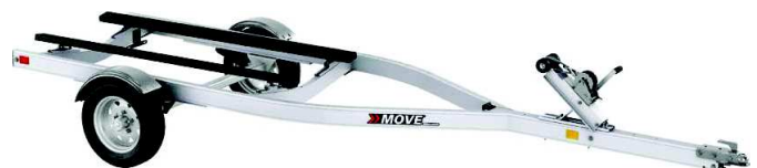
Aluminum MOVE I Extended 1250