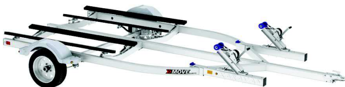
Aluminum MOVE II