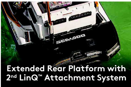
Extended Rear Platform with 2 nd LinQ™ Attachment System

A spacious, quick-attach fishing cooler designed for easy access and equipped with numerous convenient features.