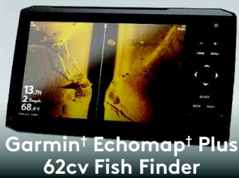
Garmin® Echomap® Plus 62cv Fish Finder

A top-of-the-line navigation, charting and fish-finding system using CHIRP technology for high definition images.