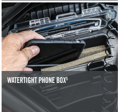
WATERTIGHT PHONE BOX 5