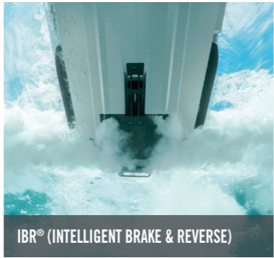
iBR® (INTELLIGENT BRAKE & REVERSE)