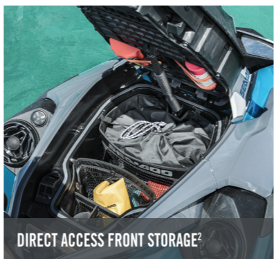
DIRECT ACCESS FRONT STORAGE 2