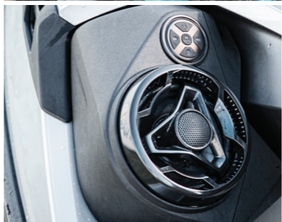
BRP AUDIO PREMIUM (OPTIONAL) 4